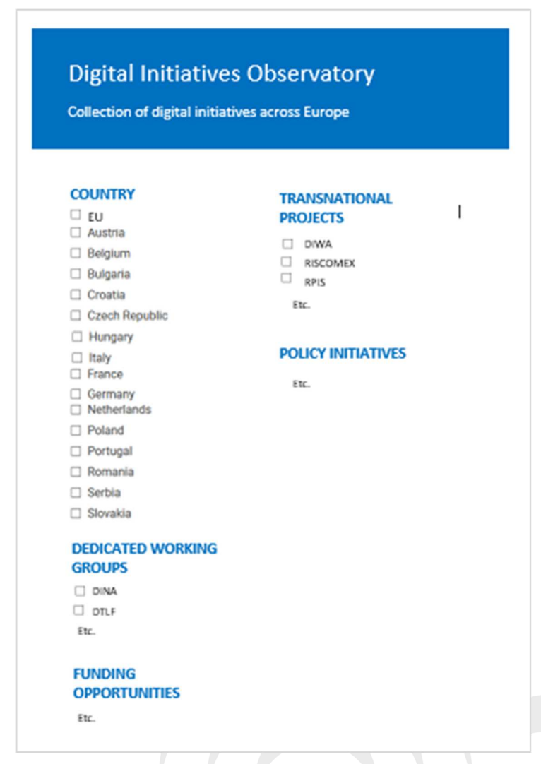
Figure 3: Concept for Digital Initiatives Observatory

The following figure provides an overview on the concept of the Digital Initiatives Observatory: