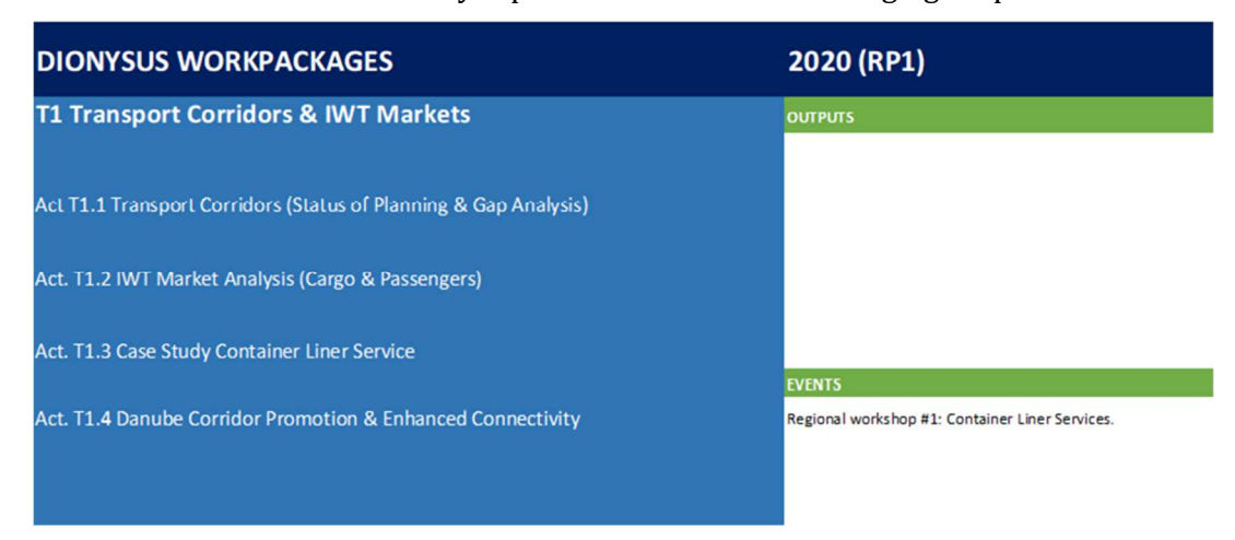
Figure 4: Synergies arising from WP T1

In the framework of the workpackage dealing with Transport Corridors and IWT Markets (T1) , one key event will be organised to disseminate the results of the DIONYSUS project as well as to collect know-how from industry representatives. The following figure provides a detailed overview: