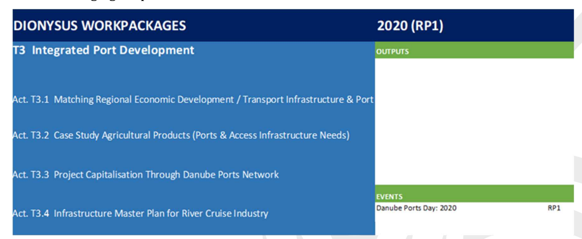
Figure 5: Synergies arising from WP T3

The following figure provides a detailed overview: