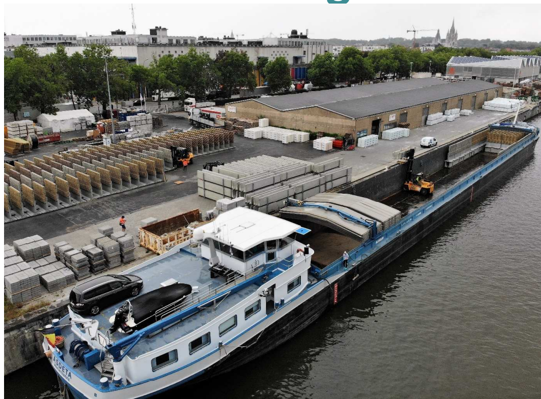
Port of Brussels