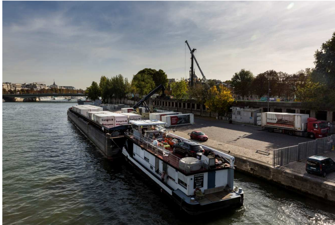
Port of Paris