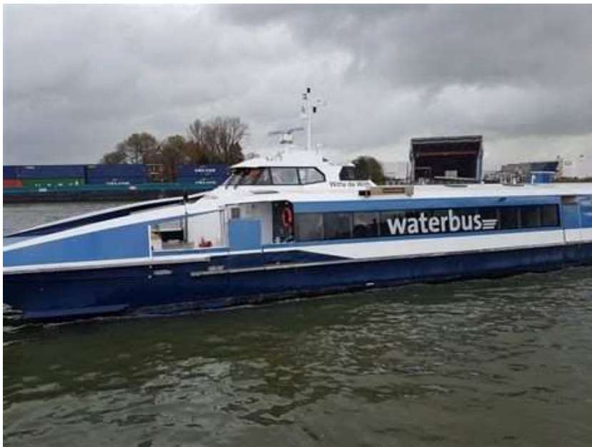
Port of Rotterdam