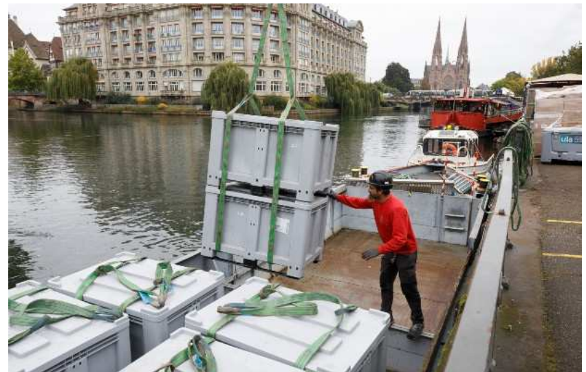
Port of Strasbourg