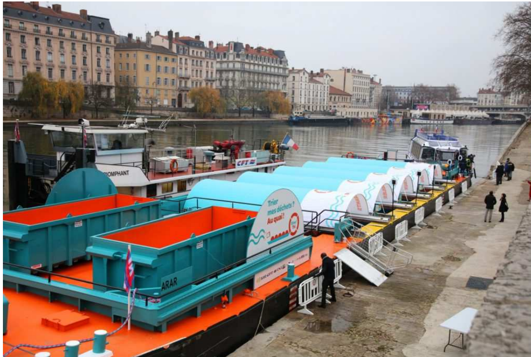
Port of Lyon