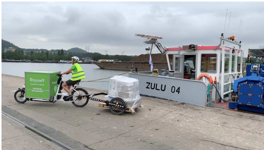
Port of Liege